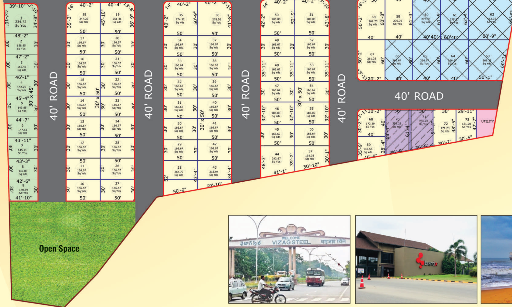
Proposed 40 Feet Road in Master Plan